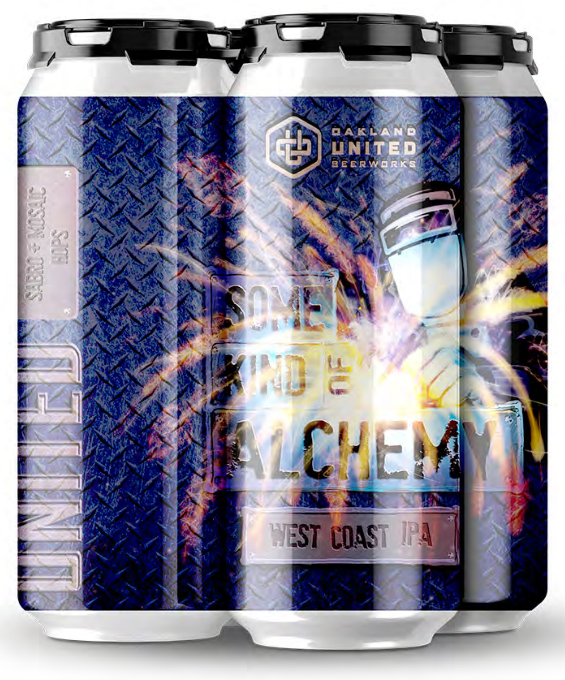
OAKLAND UNITED BEERWORKS OAKLAND, CA | SOME KIND OF ALCHEMY WC IPA