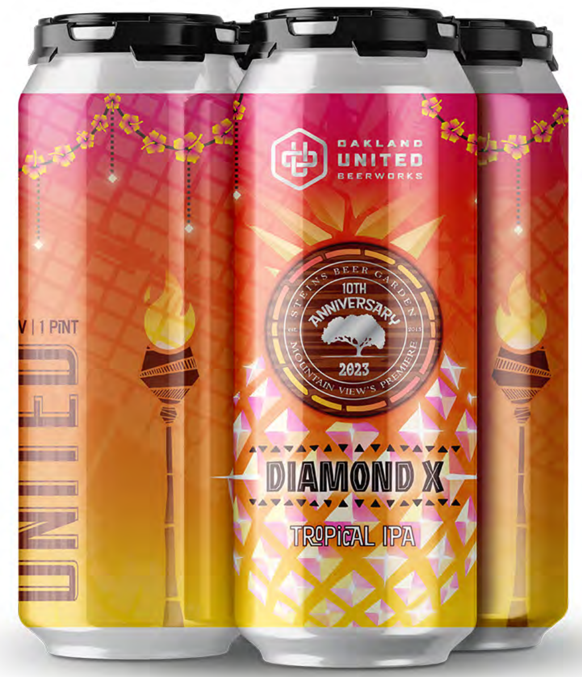
OAKLAND UNITED BEERWORKS OAKLAND, CA | DIAMOND X IPA