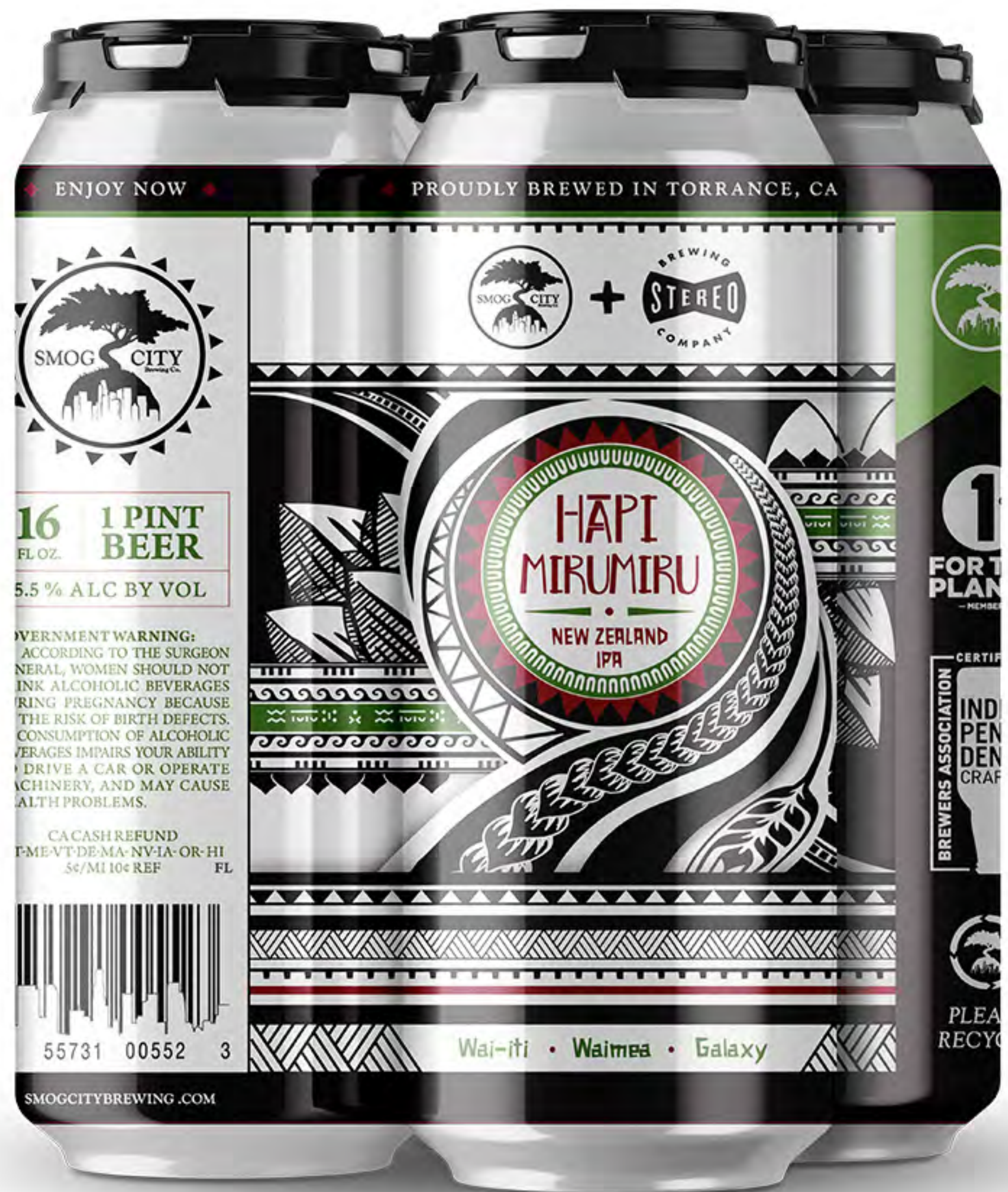
SMOG CITY BREWING TORRANCE, CA | HAPI MIRUMIRU NEW ZEALAND IPA