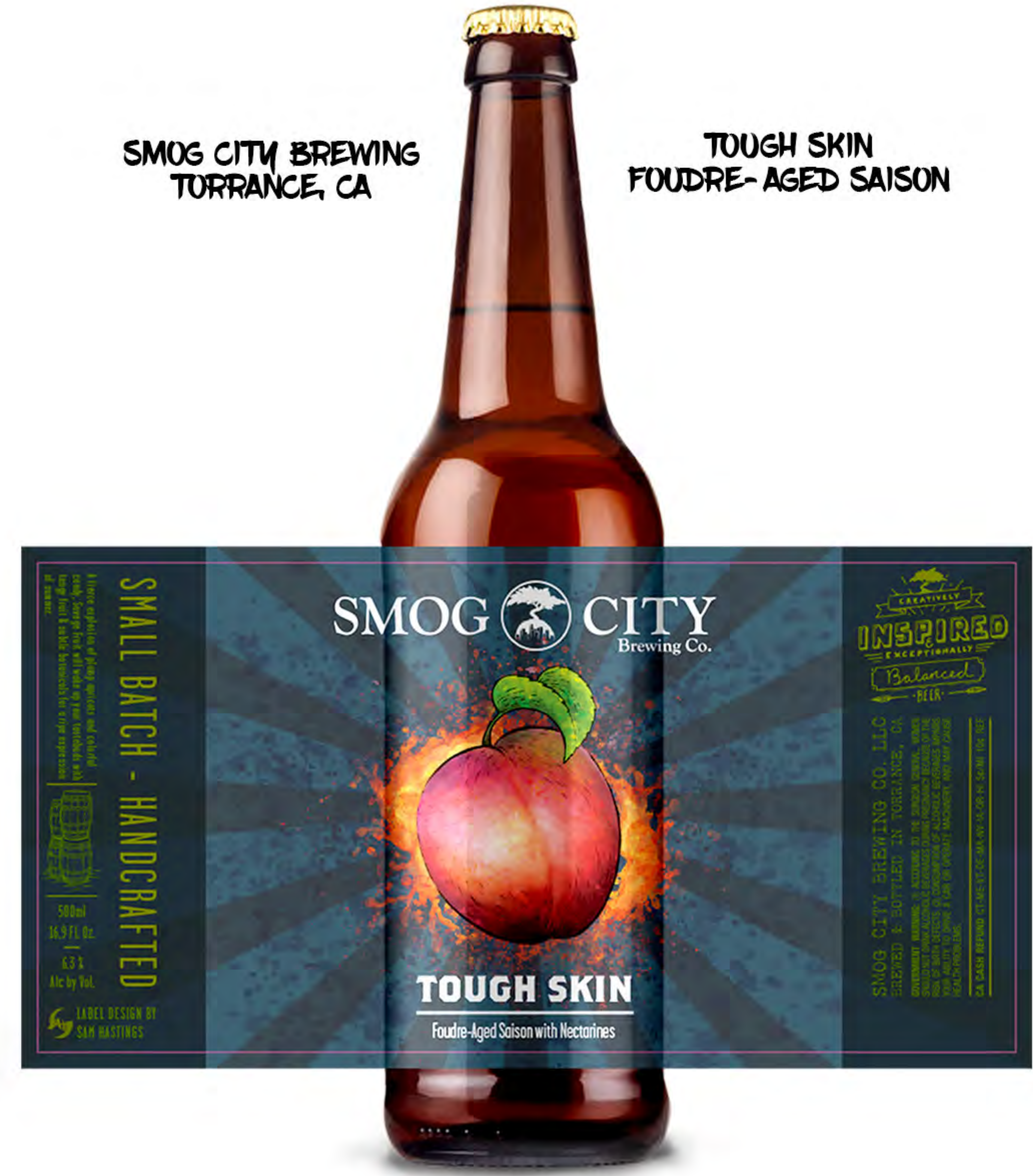
SMOG CITY BREWING TORRANCE, CA | TOUGH SKIN FOUDE-AGED SAISON