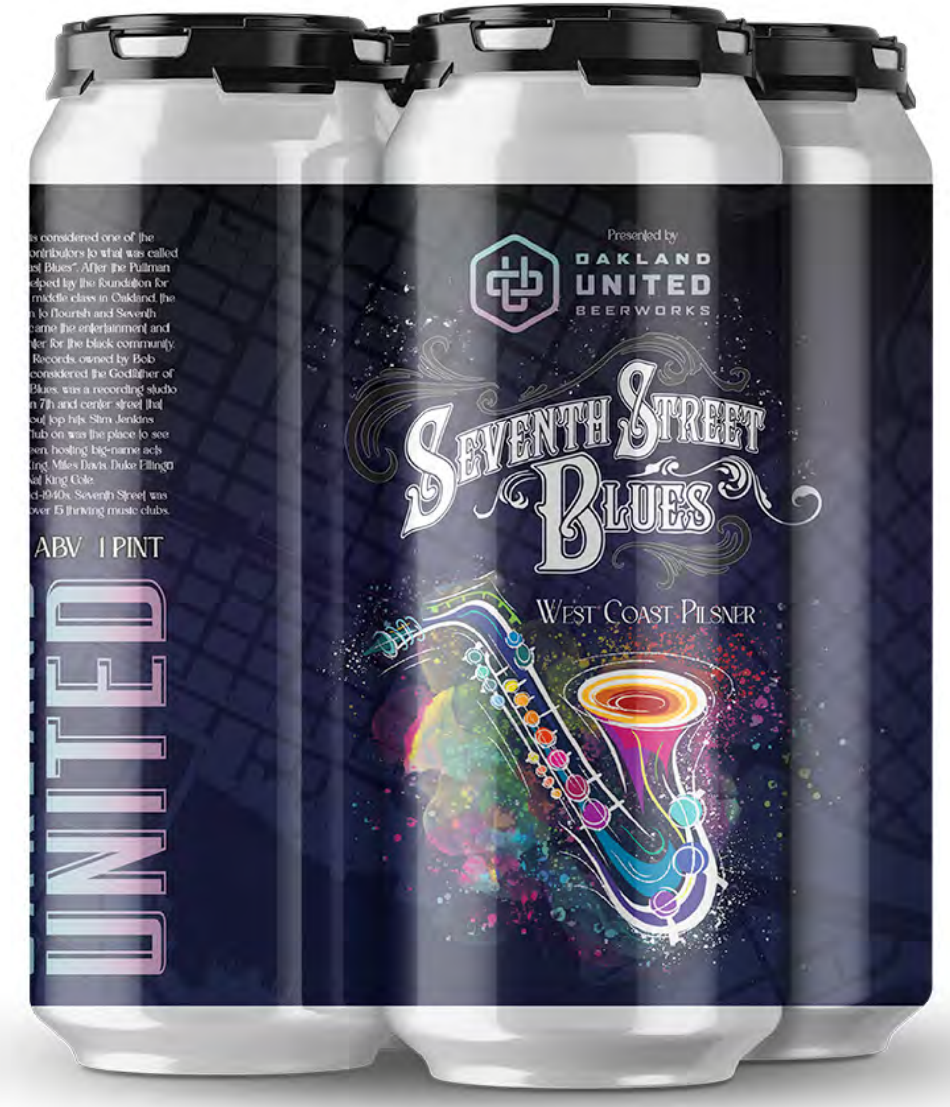
OAKLAND UNITED BEERWORKS OAKLAND, CA | 7TH ST. BLUES WC PILSNER