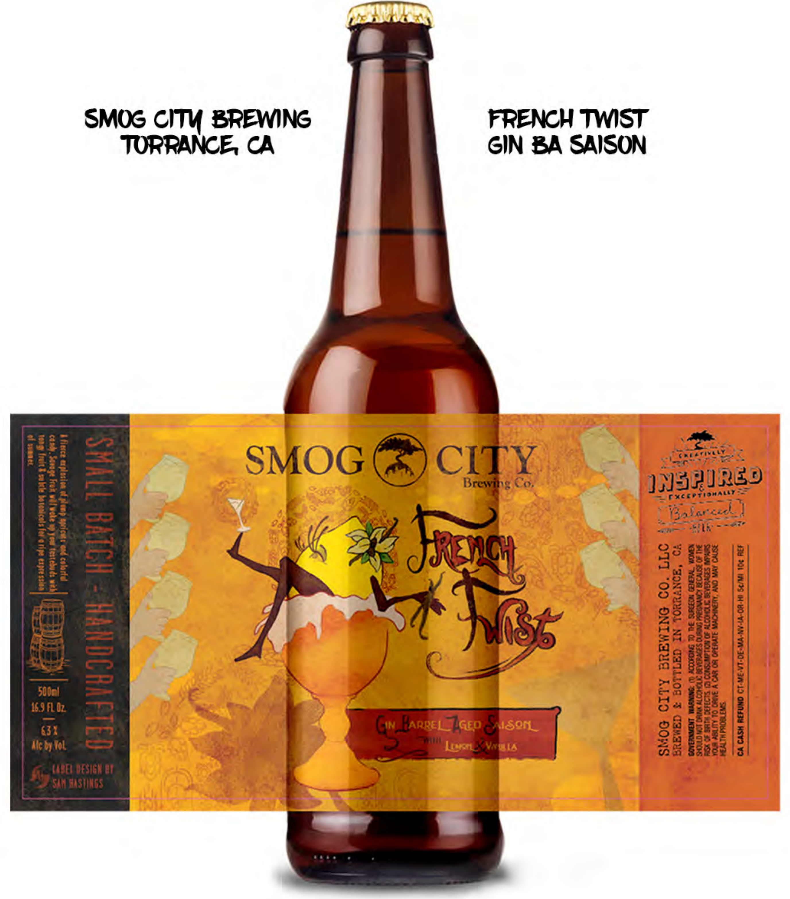
SMOG CITY BREWING TORRANCE, CA | FRENCH TWIST GIN & SAISON