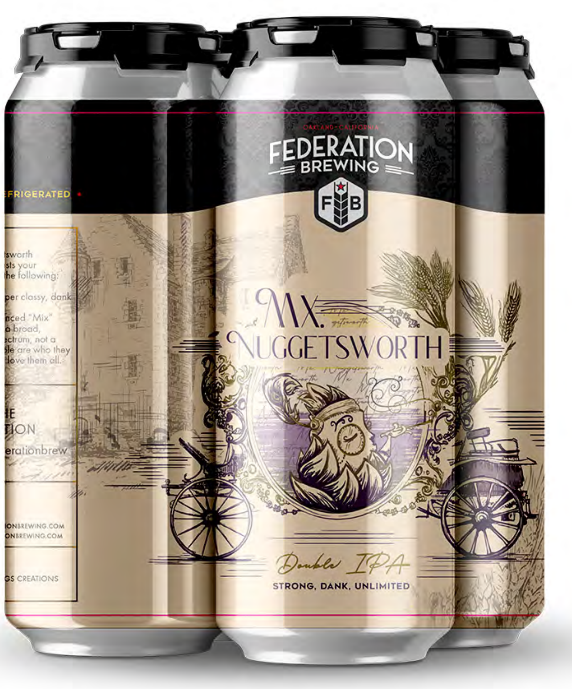
FEDERATION BREWING OAKLAND, CA | MX. NUGGETSWORTH DOUBLE IPA