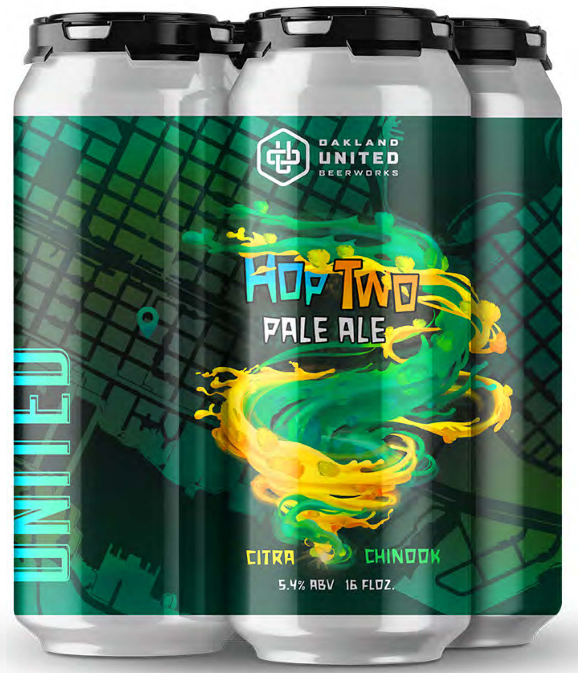
OAKLAND UNITED BEERWORKS OAKLAND, CA | HOP TWO PALE ALE