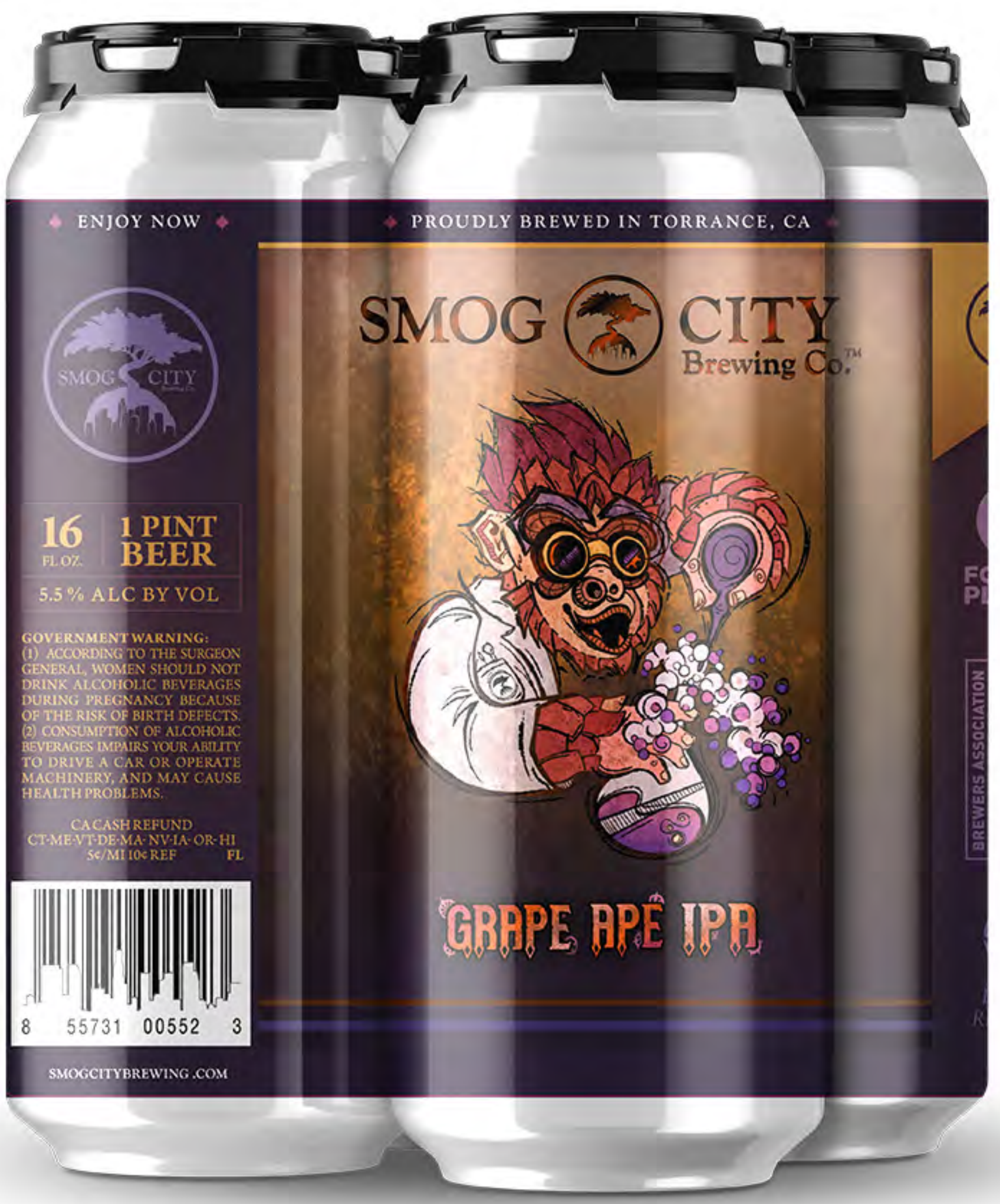
SMOG CITY BREWING TORRANCE, CA | GRAPE APE IPA