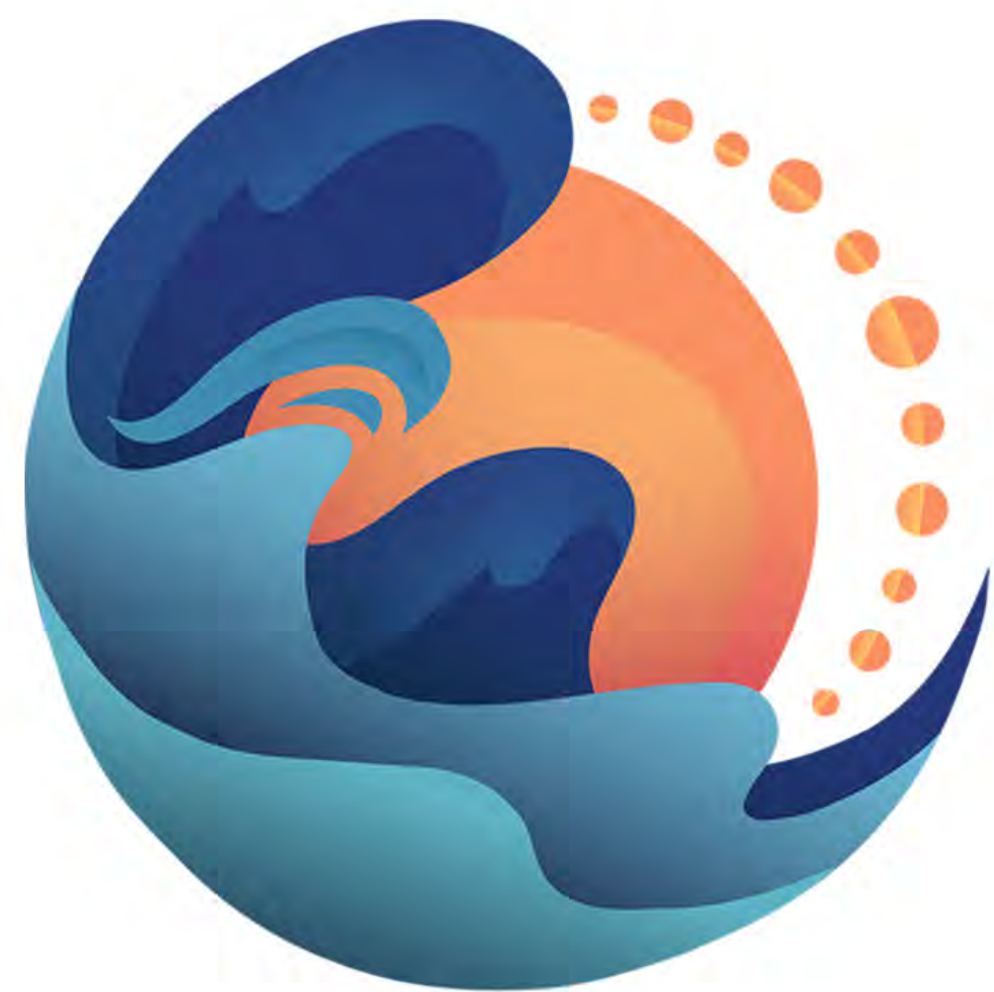
full gradient logo